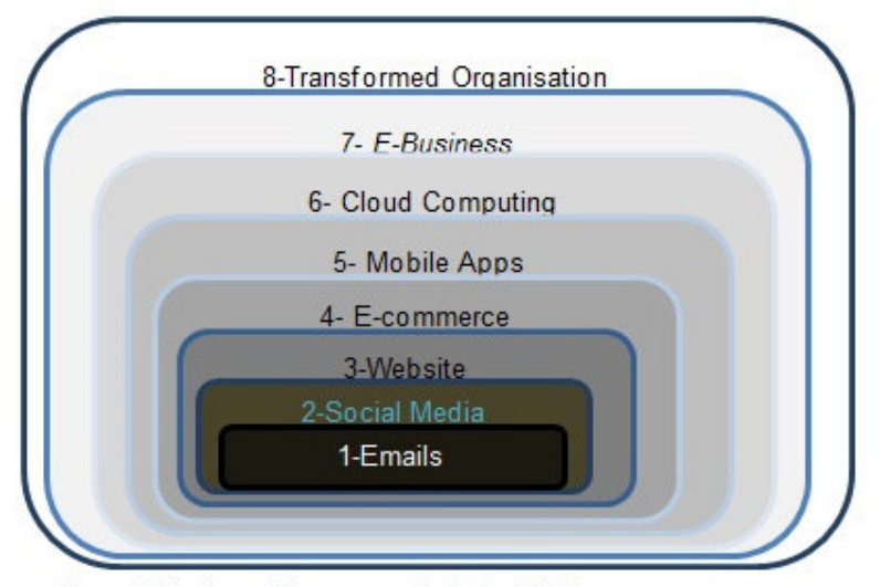
Figure 1 E-business Measurement Evolution Model

Stage six (Cloud Service) means the business uses cloud services to store their files, software and applications services. The business will be able to access the applications and services across a range of devices and networks from anywhere. Stage seven (E-business) means the on-line "store" is integrated with other business systems, e.g. order processing, fulfilment, accounts and/or marketing. Stage eight (Transformed Organisation) means internet technology drives the business internally and externally, and is used to manage all processes end-to-end more effectively and efficiently (see figure 1).