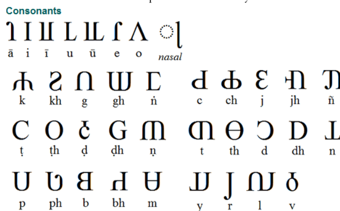
Fig. 1. Akkhara-Muni- A PALI Alphabet

Optical Character Recognition (OCR) attempted first in 1870, developing from era of 40's while transforming from first generation to third now in present with a wide variety of applications in numerous fields from banking to education, archaeology to space science. Entire work is done on local database of Akkhara-muni script collected online by numerous resources and is shown as: