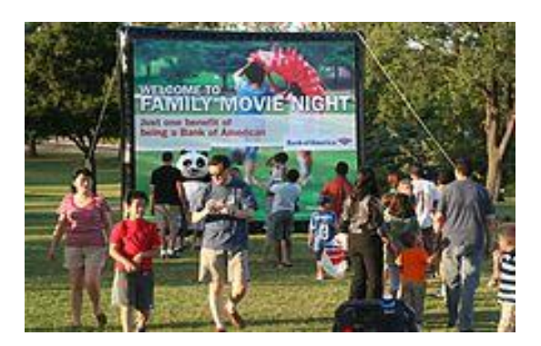
Mobile inflatable billboard

Mobile billboard - Mobile billboards offer a great degree of flexibility to advertisers. These advertisements can target specific routes, venue or events, or can be used to achieve market saturation. A special version is the inflatable billboard which can stand free nearly everywhere. This product can also be used for outdoor movie nights.