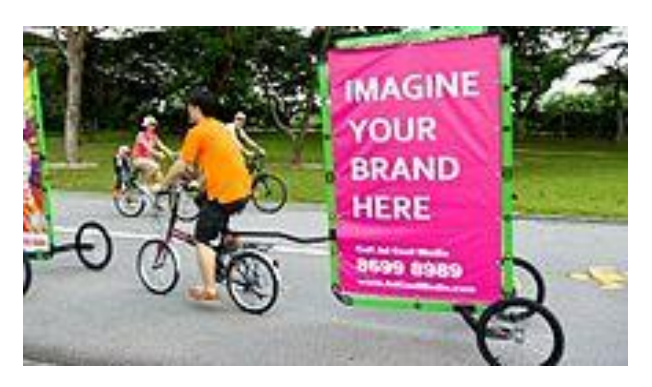
Billboard Bicycle in East Coast Park, Singapore

Billboard bicycle - Billboard bicycle is a new type of mobile advertising in which a bike tows a billboard with an advertising message. This method is a cost efficient, targeted, and environmentally friendly form of advertising.