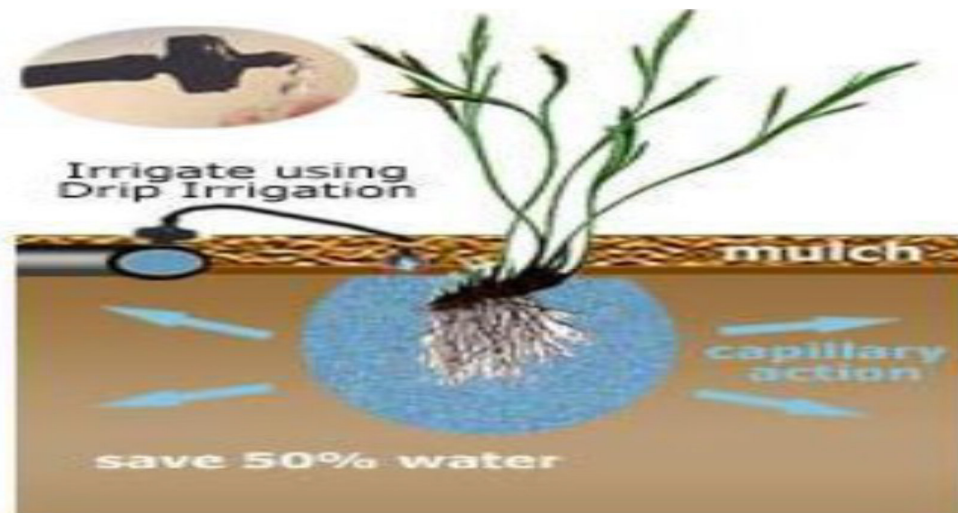
Figure 1. Drip Irrigation at Root Zone

The conventional methods of irrigation like sprinklers of overhead type, flood type irrigation systems wets the lower leaves and stem of the plants. When irrigation is done by using such methods the soil surface is often saturated and stays wet for long time after irrigation is completed. These conditions leads to infections by leaf mould fungi. The flood type methods consume large amount of water and the intermediate area between crop rows remains dry and receives water only from incidental rainfall. In order to solve this problem the drip or trickle irrigation is used which is a type of modern irrigation technique that slowly applies small amounts of water to part of plant root zone [4]. Water is supplied frequently, often daily to maintain favorable soil moisture condition and prevent moisture stress in the plant with proper use of water resources.