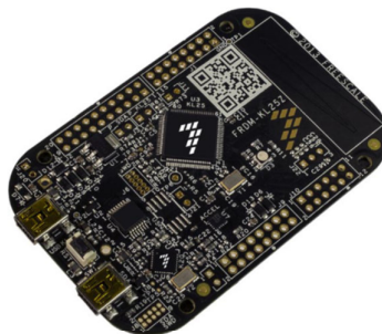
Fig.3 Freescale Freedom Board FRDM-KL25Z

The main hardware component used is Freescale Freedom board FRDM-KL25Z. Simply saying Freescale Freedom board FRDM-KL25Z itself is the electronic controller unit. The Freescale Freedom KL25Z hardware, FRDM-KL25Z, is a capable and cost-effective design featuring a Kinetis L series microcontroller, the industry's first microcontroller built on the ARM® Cortex™-M0+ core. A Freescale MMA8451Q low-power, three-axis accelerometer is interfaced through an I2C bus and two GPIO signals. It features a KL25Z128VLK, a device boasting a max operating frequency of 48MHz, 128KB of flash, a full-speed USB controller, and loads of analog and digital peripherals.