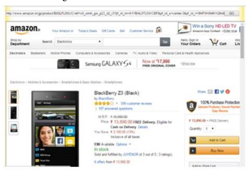
Fig 3. URL based Product from Amazon