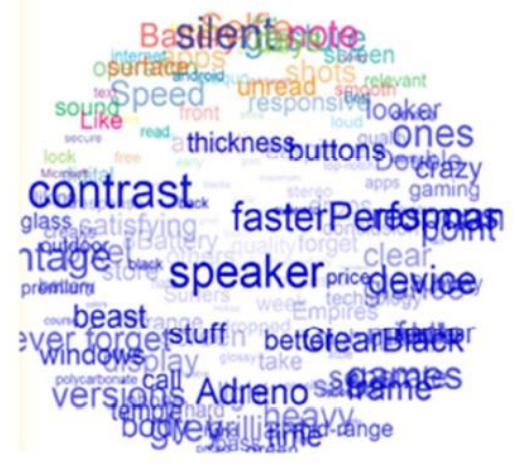
Fig.1. Overall Rating in 3D view

Product Aspect ranking framework is used for analysing the reviews. We start with an overview of its pipeline. It consisting of three main components: aspect identification, sentiment classification on aspects and probabilistic aspect ranking. To given the product with consumer reviews, to identify first the aspects in the reviews and then analyze consumer opinions on the aspects via a sentiment classifier.