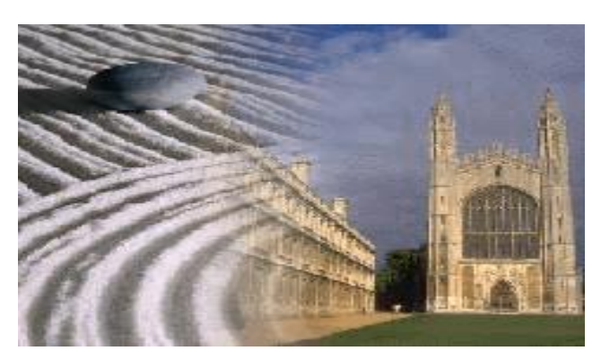
Fig-4 Wipe effect

4) Wipe- Wipes are dynamic kind of transition. When one shot pushes the other off frame, then wipe takes place.