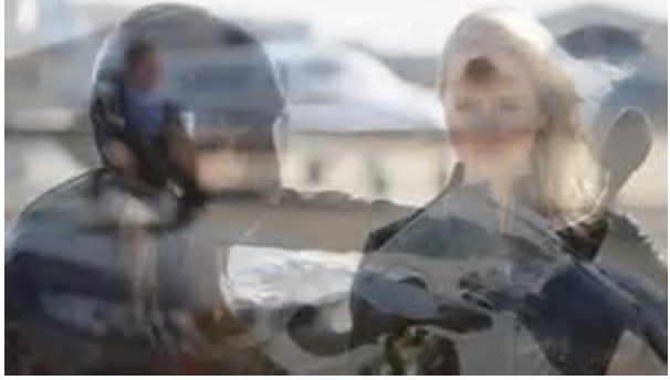
Fig3: Dissolve effect

3) Dissolve- It is also known as overlapping. Dissolve occurs when there is replacement of one shot with the next gradually. One shot disappears as the next shot appears. For some time both shots overlap each other and used to represent the passage of time.